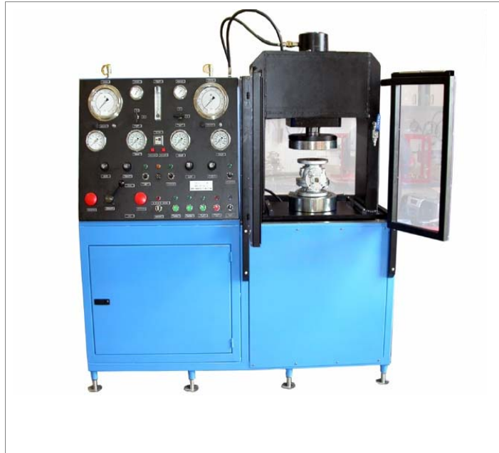
SVR Series shown with a flanged ball valve being tested.

Barbee's new SVR Series tester is similar to the popular LVR Series but without the sliding table. It is a more compact unit, but as efficient as the other models, with push button controls and panel mounted gauges.