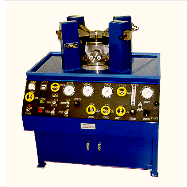
Model H-5000-S shown with a flanged 8" ball valve and seal plate for shell testing.

Barbee's S Series Tester is the most popular model available. This proven design has been around for over a decade now and still very much in demand.